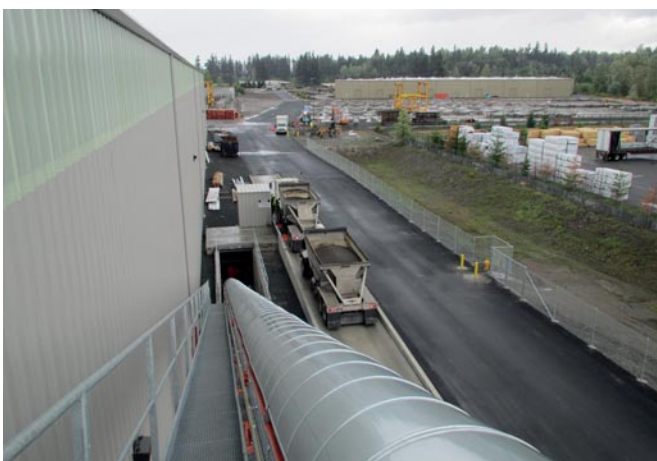
Figure 3: The new EnCon batch plant features a five-compartment, 885-ton capacity aggregate storage system from ACT that includes drive over dump hopper and conveyor system (shown here) that automatically ensures the correct aggregates are loaded into associated bins.

price; however, we had greater confidence in the ability of ACT to deliver on time and meet our specific needs," Lien explains. "We knew we had a carousel production system coming, the building laid out, and we had a delivery mechanism. We needed a batch plant vendor that could work within the confines of those specifications and deliver on demanding requirements. It had to be a design-build solution—essentially a turnkey plant."