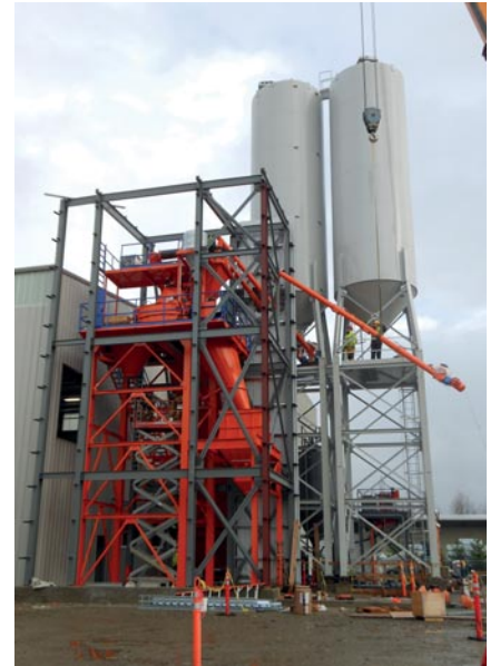
Figure 2: Under construction. The new ACT MobilMat Mo4500-5-PCS batching solution is positioned to feed EnCon's new tunnel segment production line as well as its preexisting precast retaining walls, median barriers, sound barrier panels, and commercial wall panel production lines. The new batch plant arrived from the Wiggert factory pre-assembled, pre-tested, wired and plumbed (air and water). One of the two cement silos shown here is dedicated to Portland Type 1 cement, and the other silo is split with one side containing silica fume and the other ground-granulated blast-furnace slag (GGBFS).

space, a rail-based carousel production line and flying bucket concrete delivery system, a sophisticated segment mold system, and highly automated concrete batching system from Advanced Concrete Technologies (ACT). There are also specially designed trailers to transport the finished segments. "The equipment and specifications for the tunnel segments were specified in the contract; however, the selection of the batching system was up to us," Lien says.