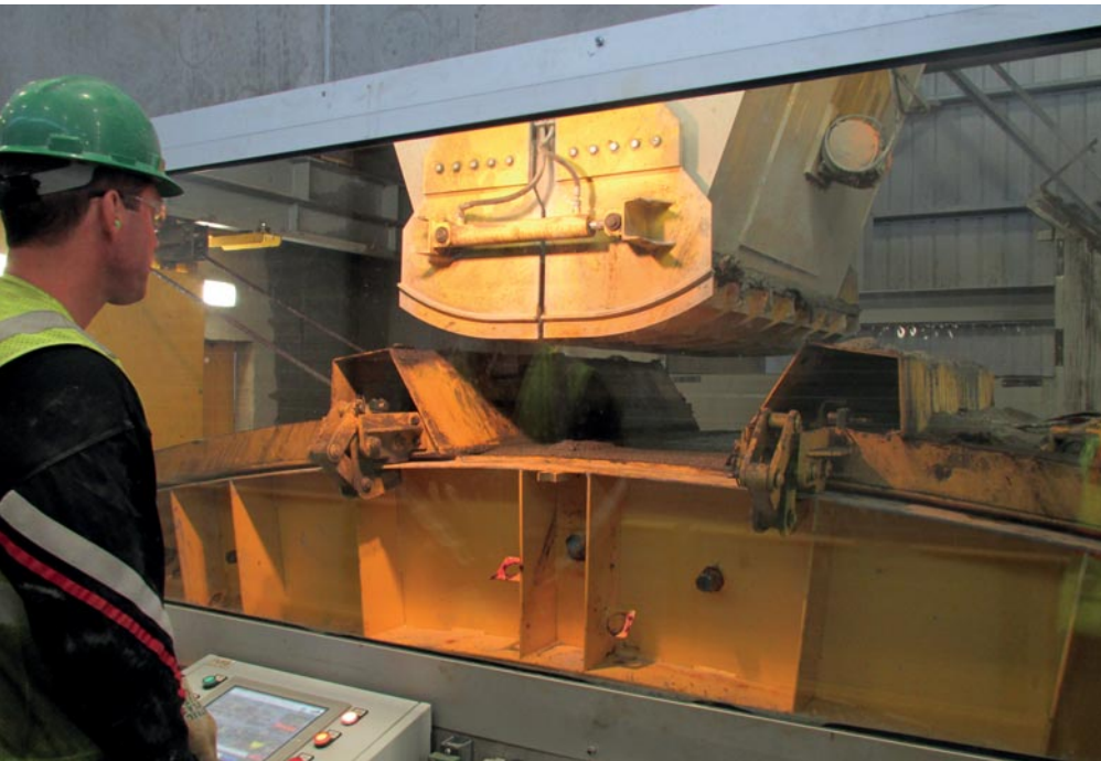
Figure 8: Skilled operators watch over every step in the tunnel production process. Here, a flying bucket has just filled the segment form. Powerful vibrators, built into the form system, ensure complete and thorough consolidation.

the water contained in the aggregates, we only add about 39 pounds of water to each yard to hit our target water/cement ratio. We have a very short window—a short pot life—and fast mixing and delivery speed is essential."