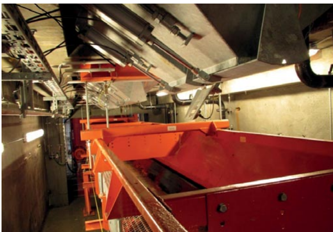
Figure 6: Weigh belt and galvanized dual-gate batching cones below aggregate storage bins for precision batching of aggregate components.