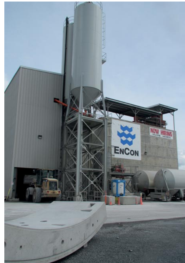
Figure 9: Completed tunnel segments are stored in the EnCon yard for about 56 days before delivery to the tunnel construction site in Seattle. The fully enclosed plant addition, shown here, enables continuous production in all types of weather.

"With this plant expansion we are achieving improvements in quality, lower labor and material production costs at the same time achieving increased product strength," Lien notes. "This investment positions our company for future growth and flexibility to deliver precast concrete products that meet market demands. We're extremely proud to be playing a key role in the development and delivery of this important transportation system. Thanks to all our vendors and our dedicated crew, we are producing the highest quality precast products possible."