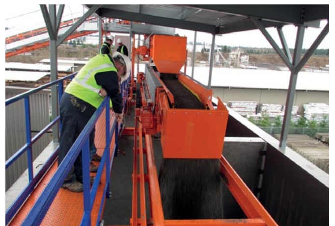
Figure 4: Shuttle belt above aggregate storage bunkers provides automated distribution of aggregates into one of five aggregate bins.