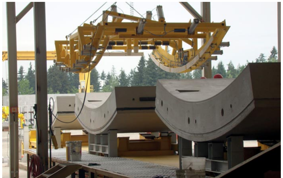
Figure 1: The system shown above is used to install a gasket on each newly cast tunnel segment prior to yarding. Each segment weighs approximately 37,500 lbs.

EnCon Washington has been in continuous operation as a PCI certified plant since 1999 and is a wholly owned subsidiary of EnCon United, based in Denver, Colorado. EnCon Washington was already a long-time producer of precast retaining walls, median barriers, sound barrier panels, and commercial wall panels—most products pro-